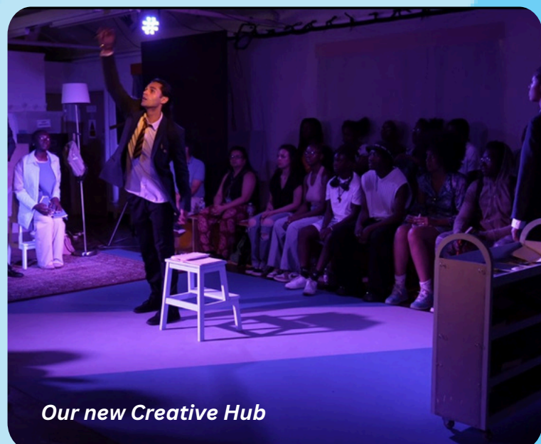
Our new Creative Hub