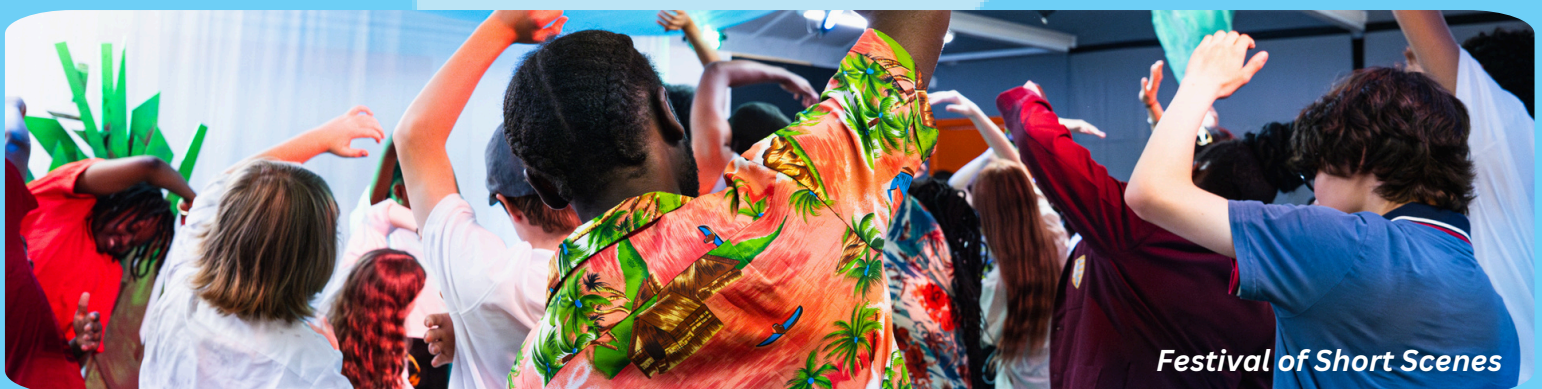
Festival of Short Scenes