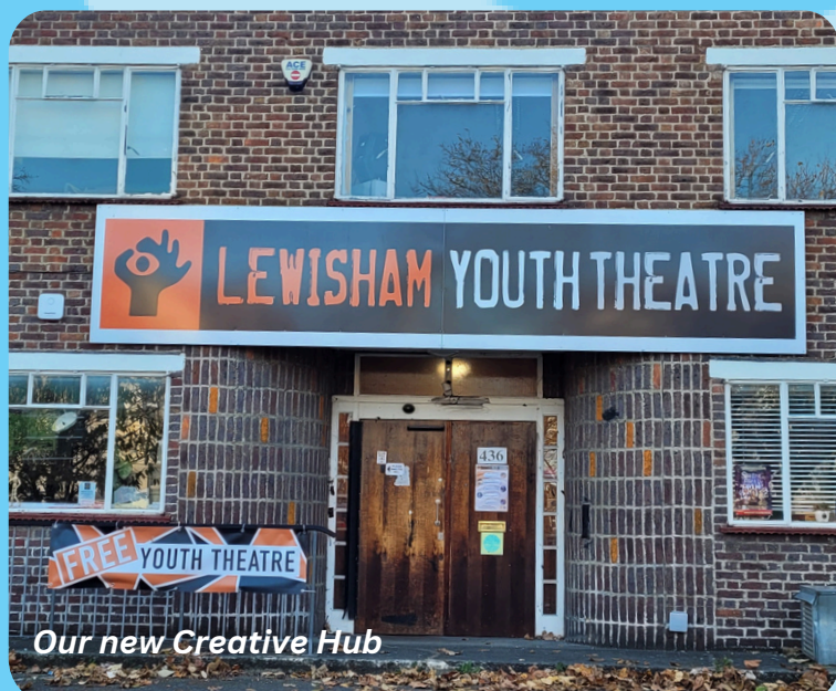
Our new Creative Hub